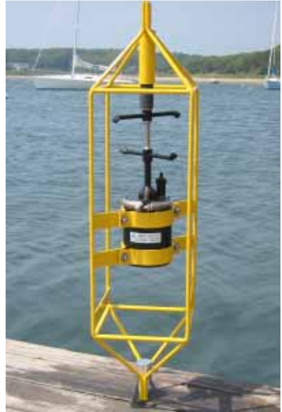
2D ACM with optional 3 ton frame